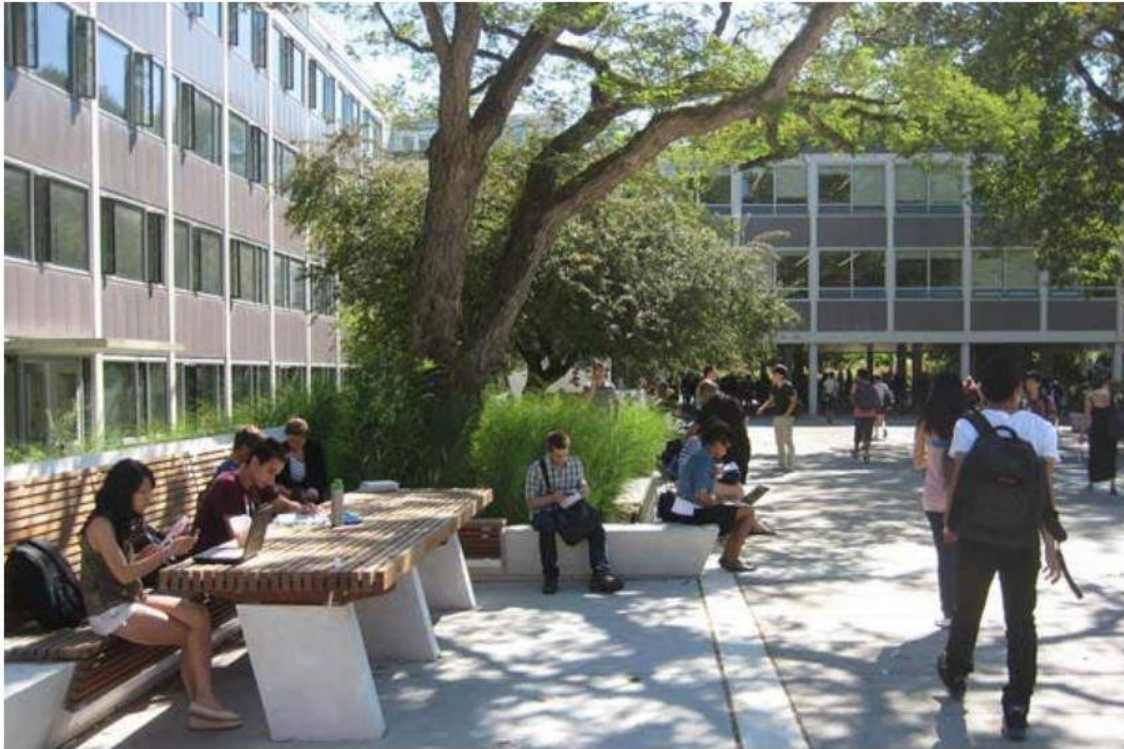
Courtyard: Like / Dislike