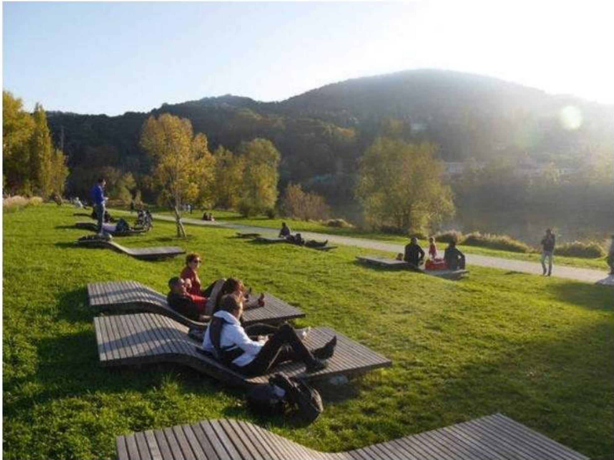
Open Space: Like / Dislike