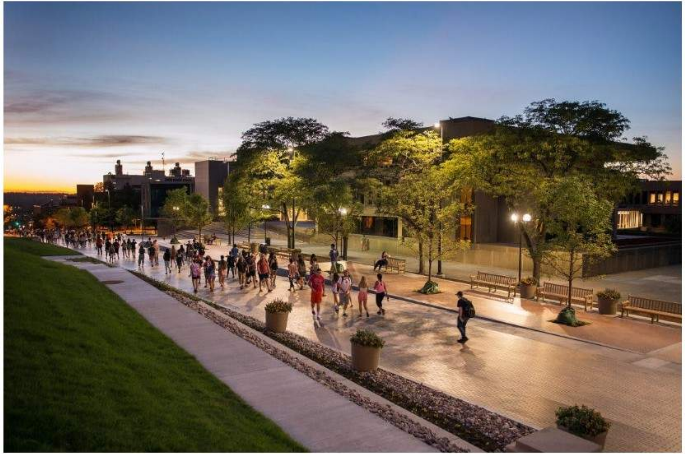
Promenade: Like / Dislike