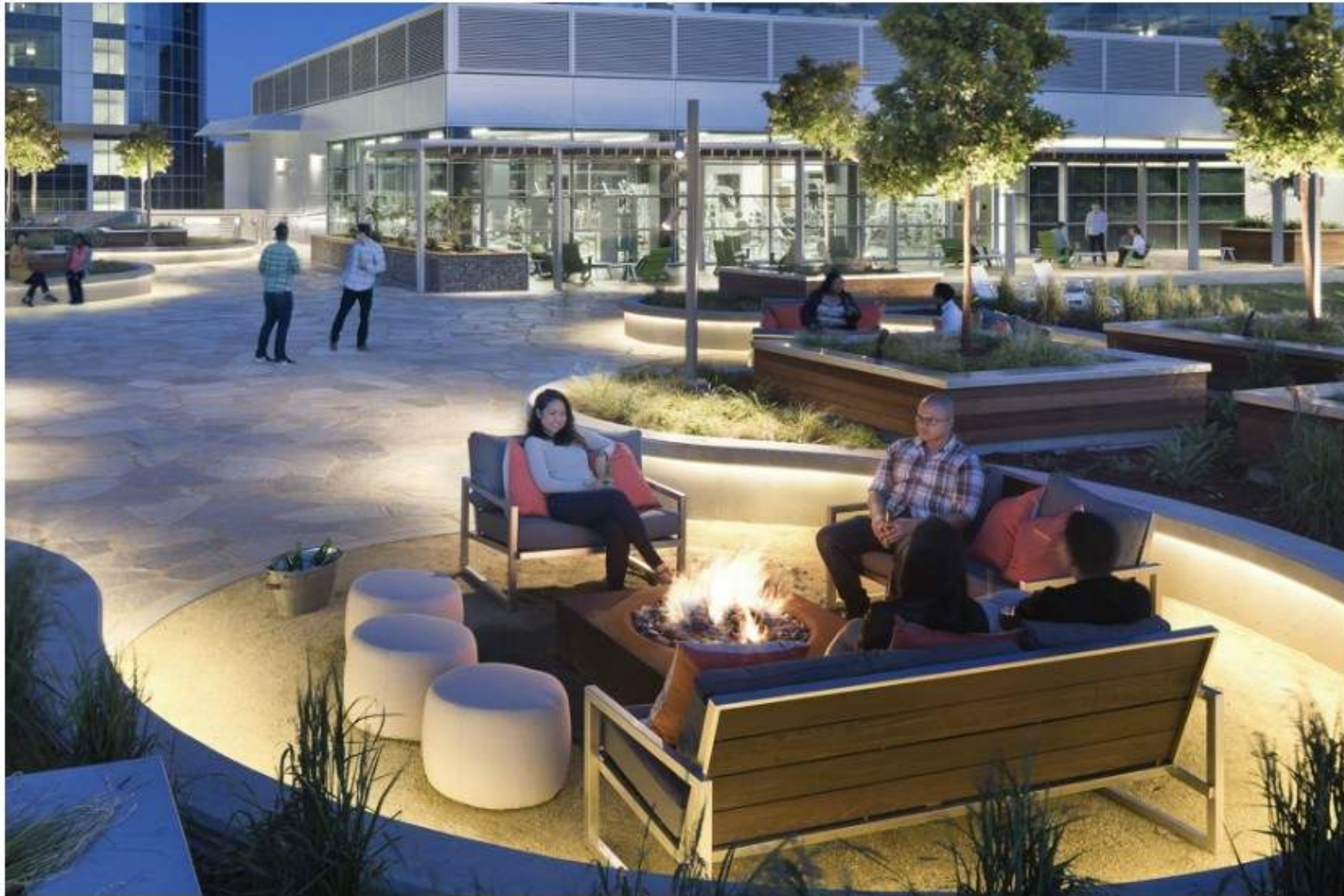
Courtyard: Like / Dislike