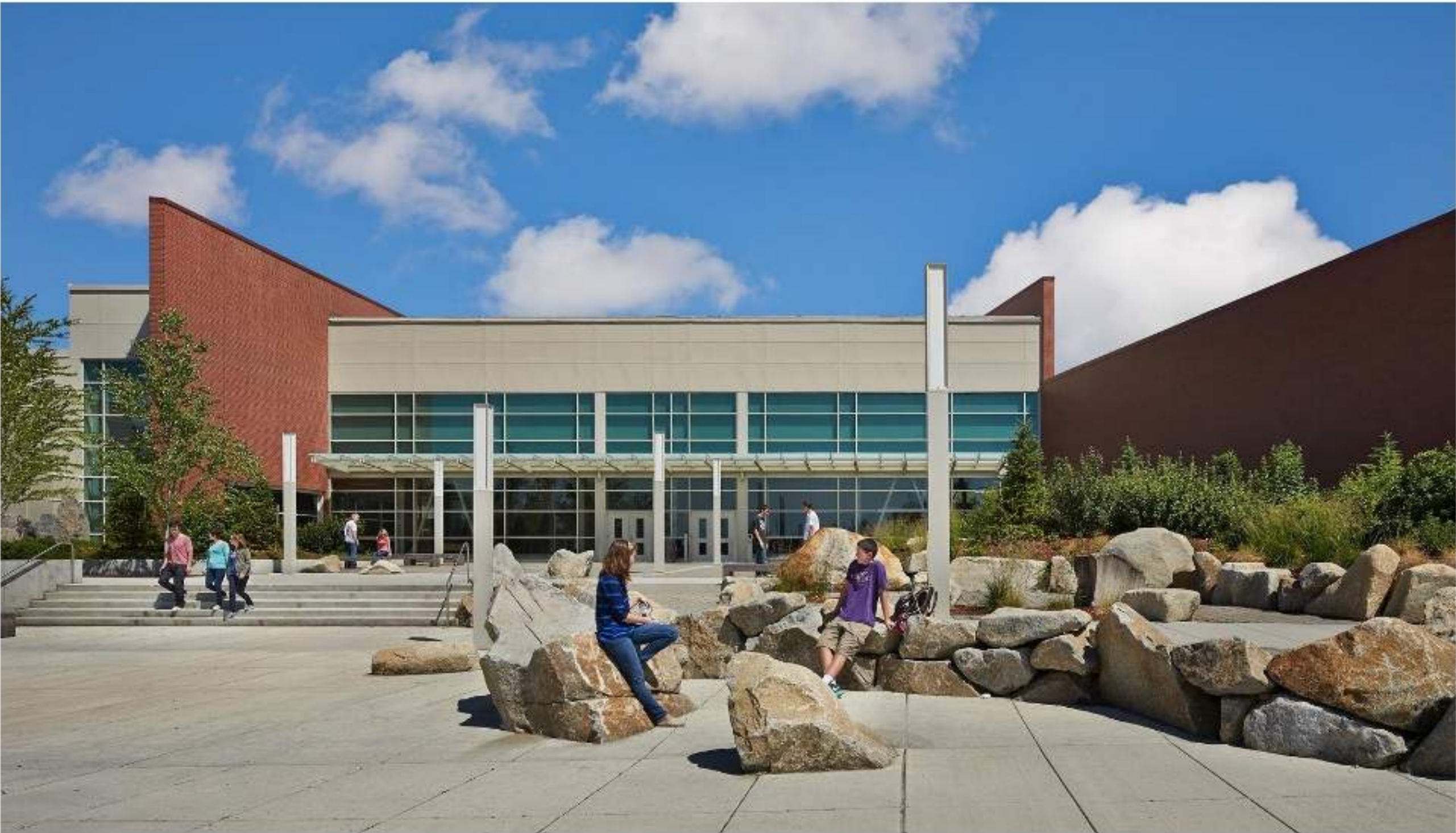
Plaza: Like / Dislike