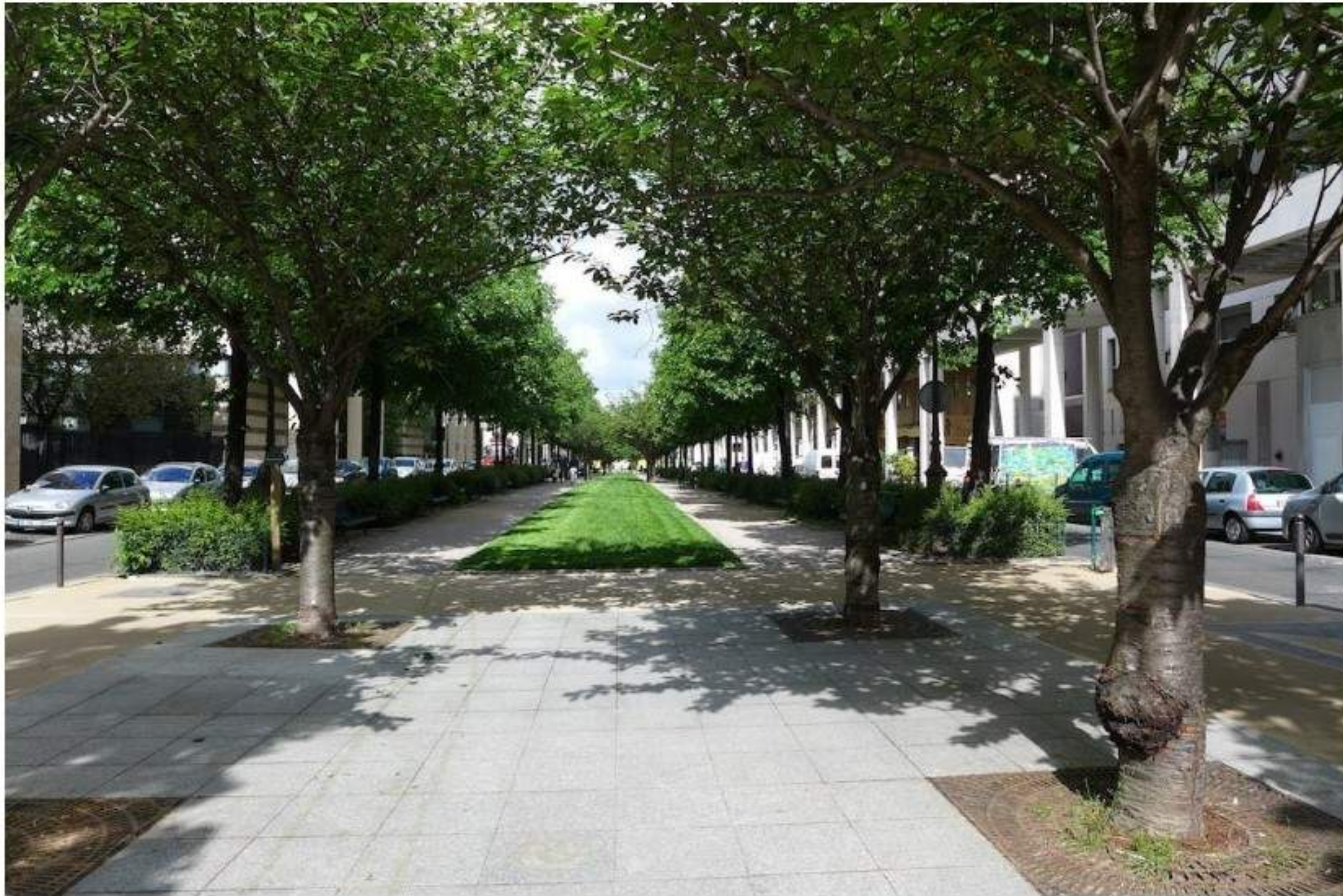
Promenade: Like / Dislike