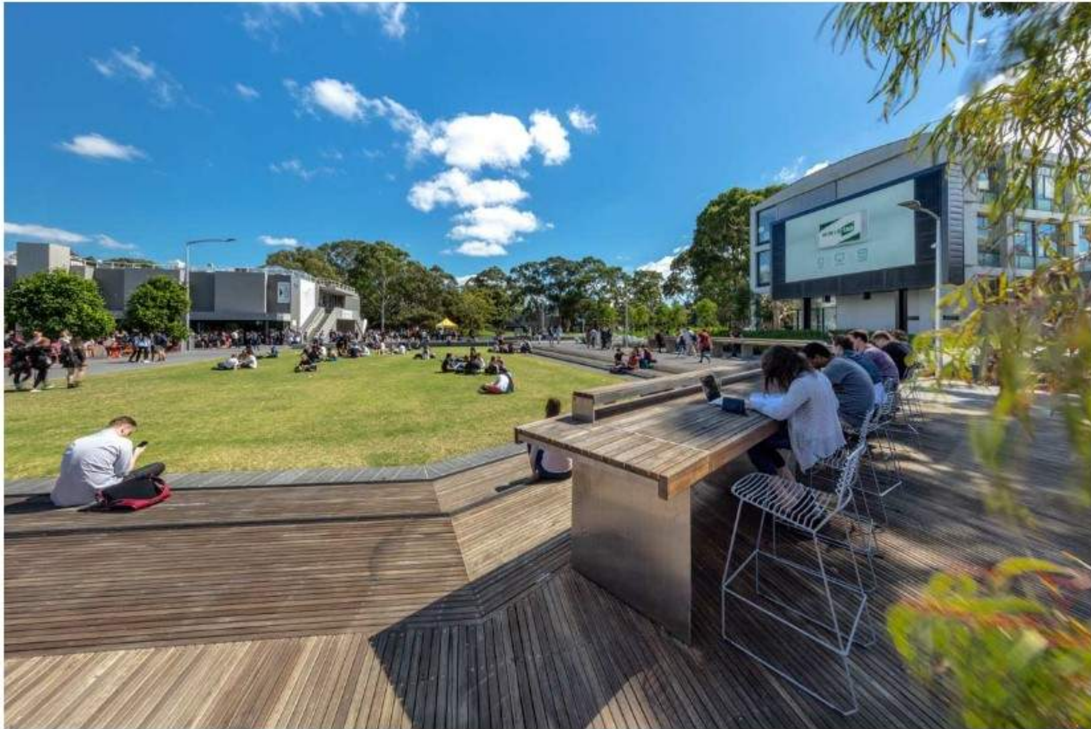
Open Space: Like / Dislike