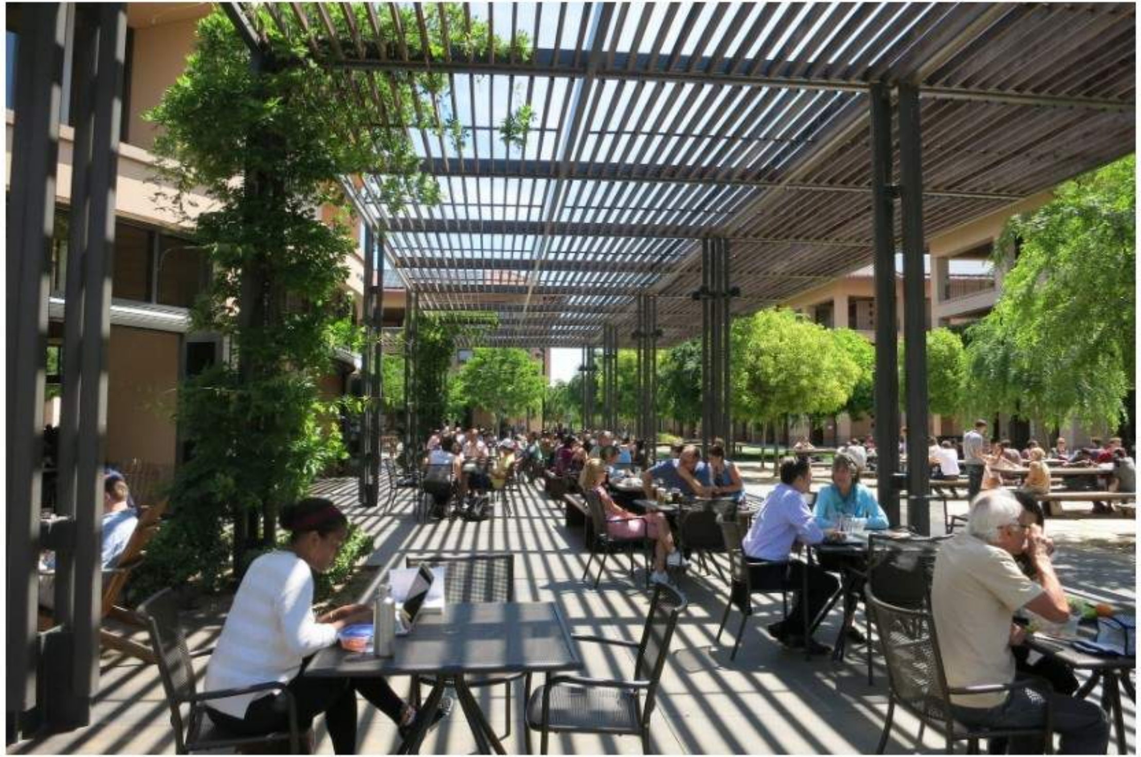
Courtyard: Like / Dislike