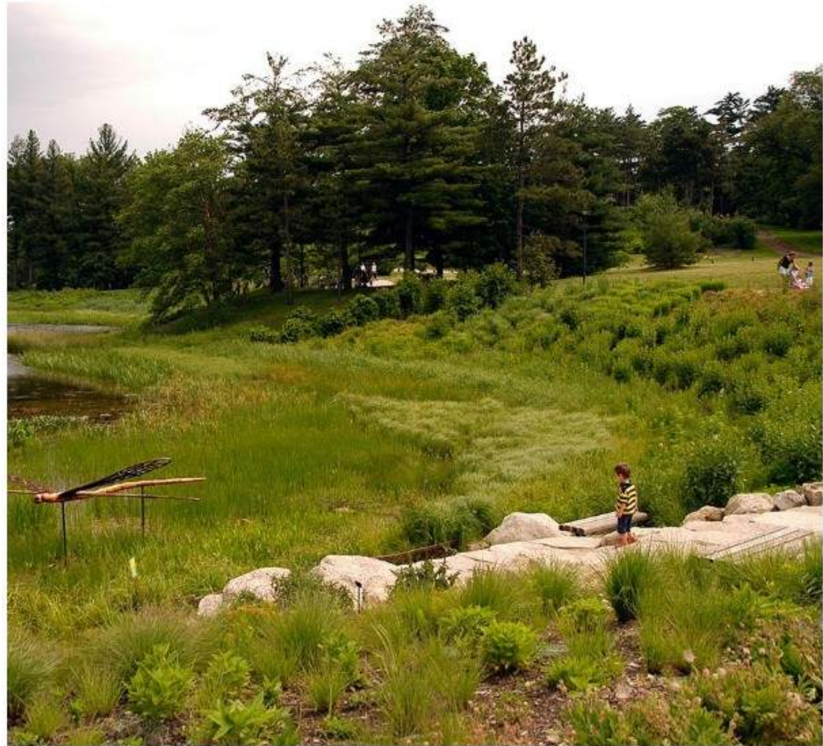
Open Space: Like / Dislike