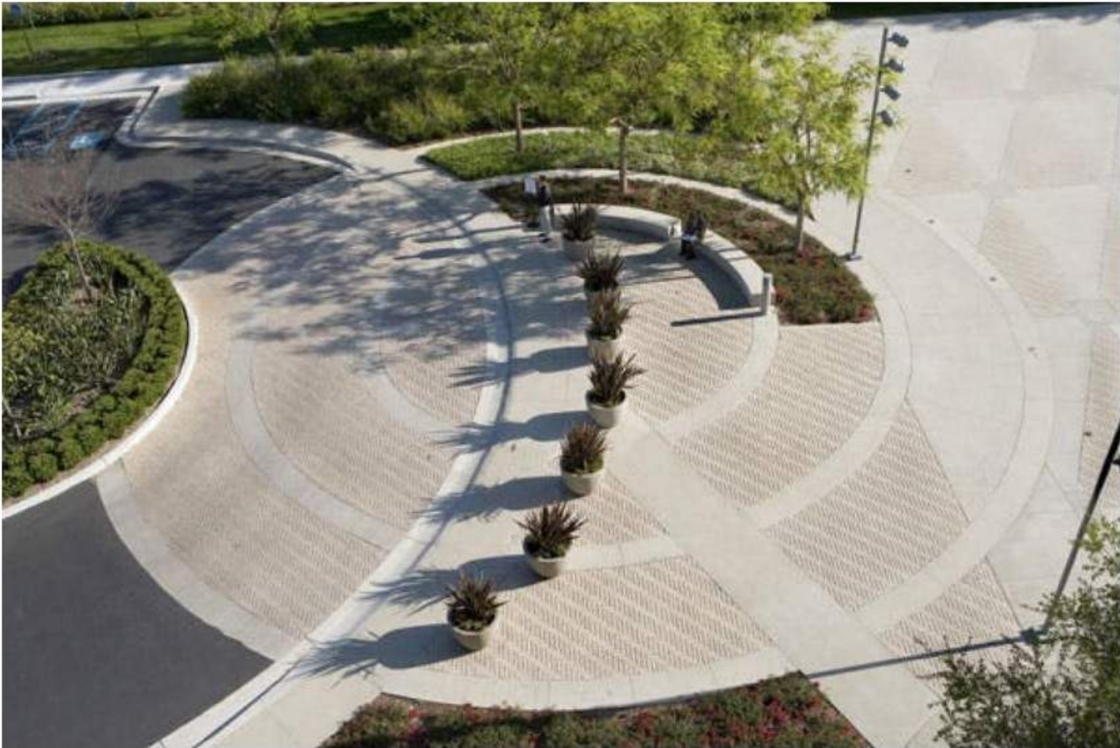
Plaza: Like / Dislike