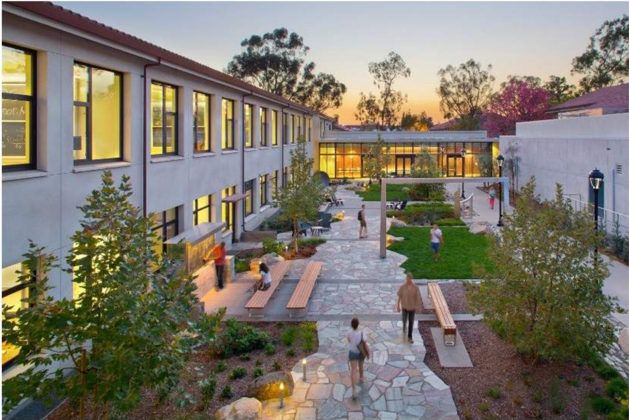
Promenade: Like / Dislike