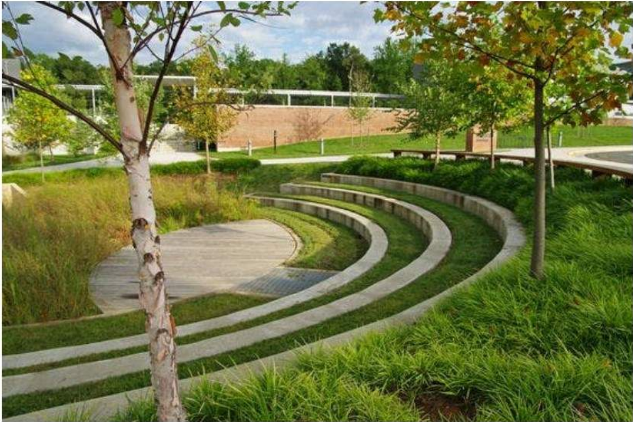
Open Space: Like / Dislike