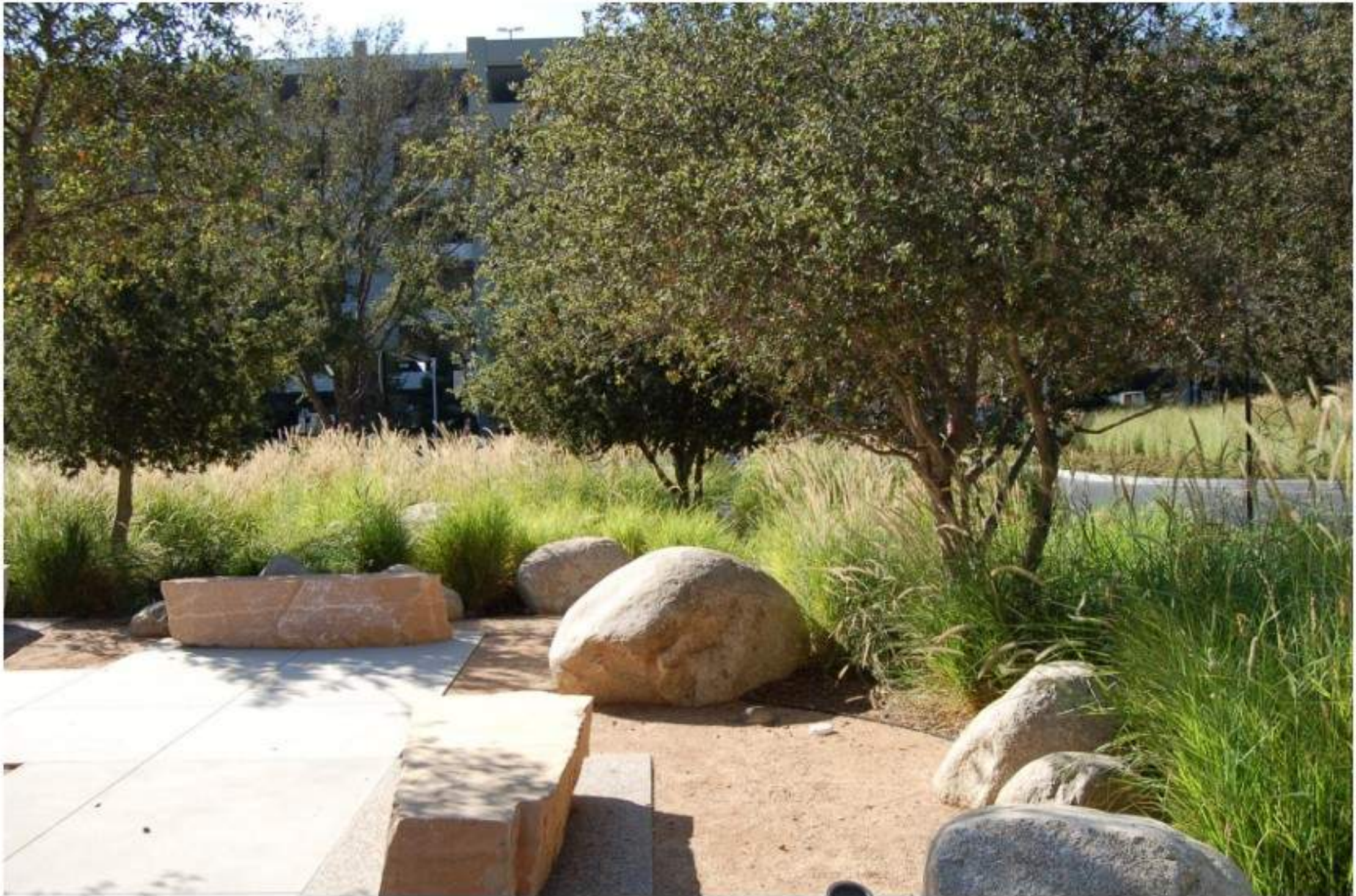
Courtyard: Like / Dislike